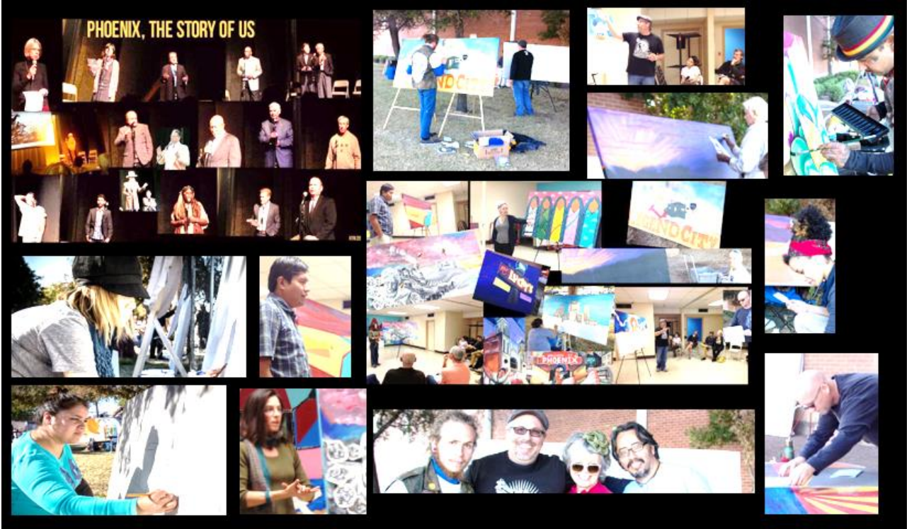
Phoenix Center for the Arts photos by Kira Olsen Photography.

First community storytelling and mural event in collaboration with Phoenix Center for the Arts. Artists commenced work at Phoenix Festival of the Arts.