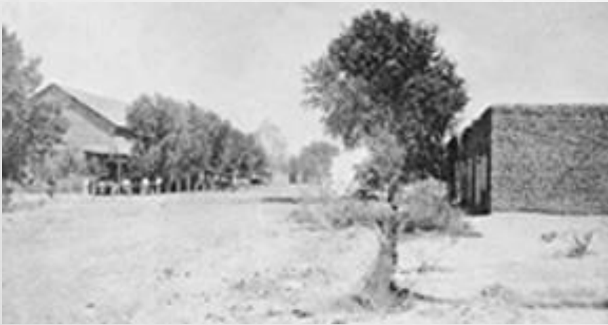
Washington Street in 1870