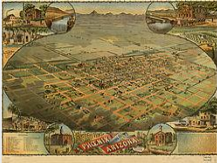
An aerial lithograph of Phoenix from 1885.